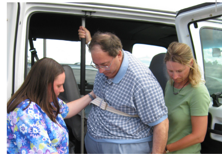
Therapy sessions can take place out in the community as another way for patients to practice daily living skills.

For meeting location, dates and times, please call 810-342-4220.