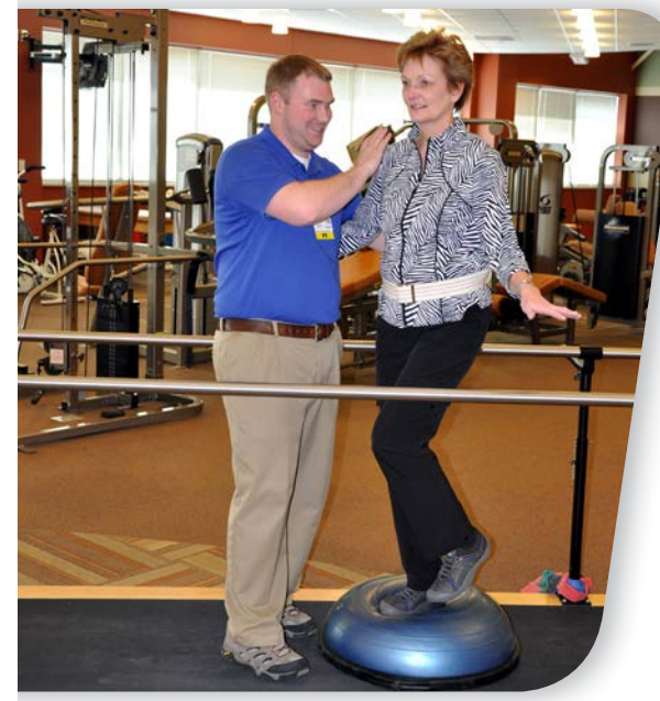
Balance retraining customized to individual patient needs.