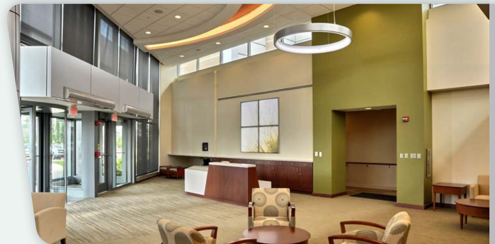
Karmanos Proton Therapy Center Lobby