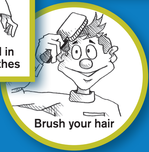
Brush your hair