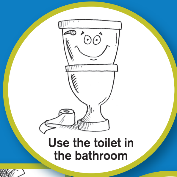
Use the toilet in the bathroom

To get the most out of your Inpatient Rehab experience, and help prepare you to go home, here are some activities you should do every day: