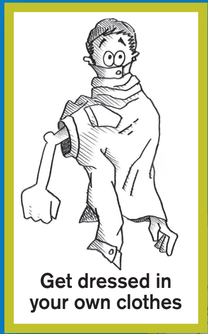
Get dressed in your own clothes