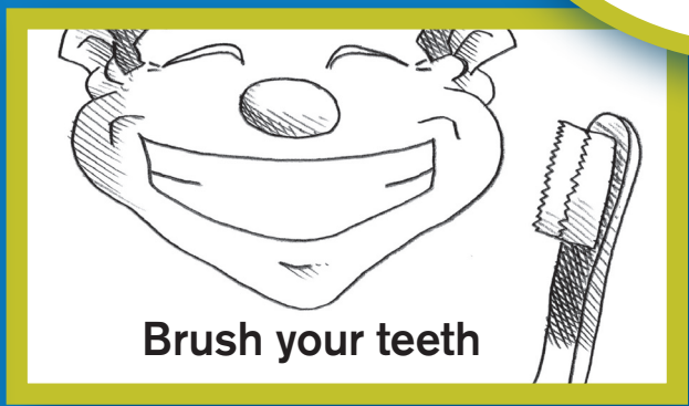
Brush your teeth