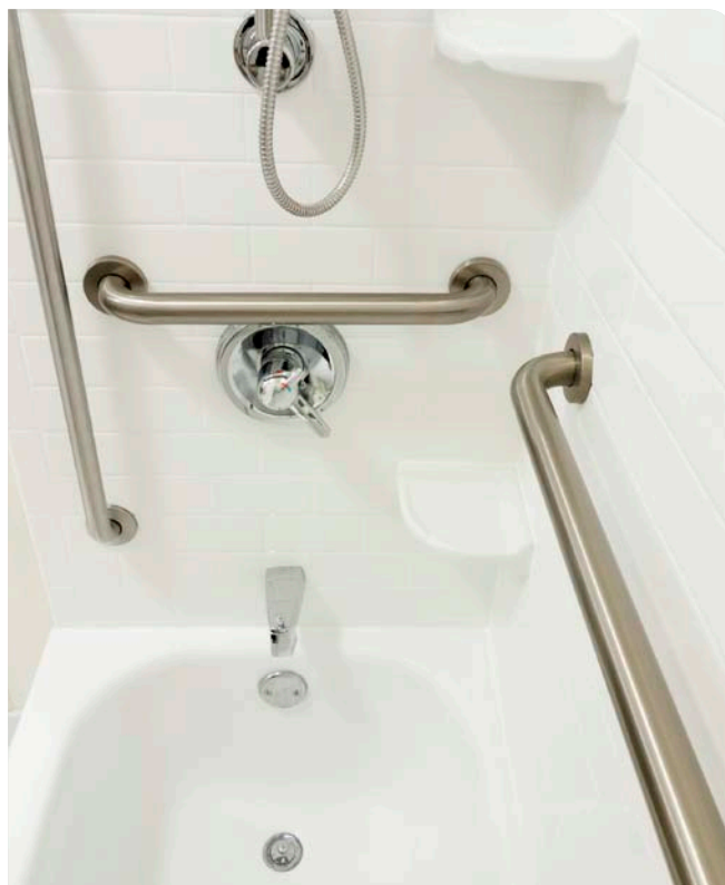
For your safety, you may need to have handrails installed in your bathroom.

Most stroke survivors are able to return home and resume many of the activities they did before the stroke. Leaving the hospital may seem scary at first because so many things may have changed. The hospital staff can help prepare you to go home or to another setting that can better meet your needs.