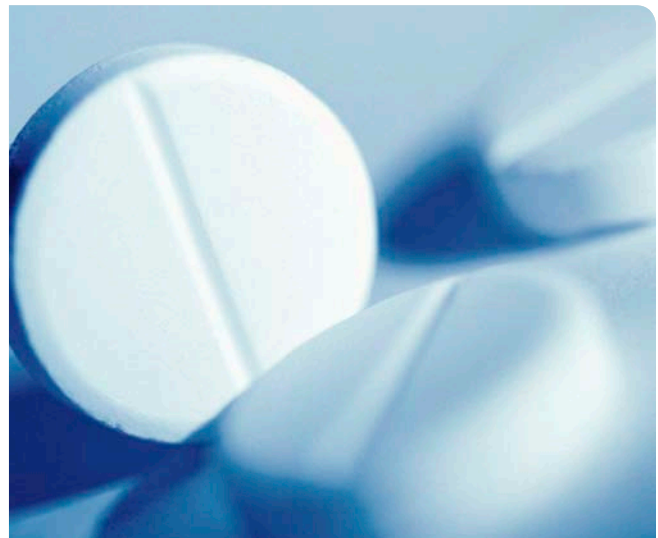
Aspirin is an antiplatelet drug that is often prescribed to treat heart problems and to prevent stroke.