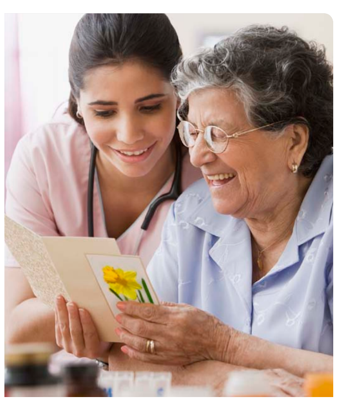
Hiring a home health aide is a great way to give yourself a break from the rigors of being the primary caregiver.

Finding caregiver training locally can be hit or miss. A good place to start is with your local Area Agency on Aging. Visit eldercare.gov to find an office near you.